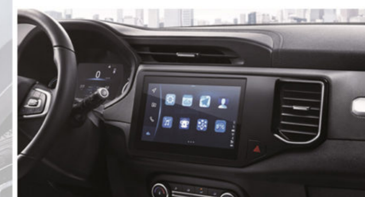
9" HD TOUCHSCREEN