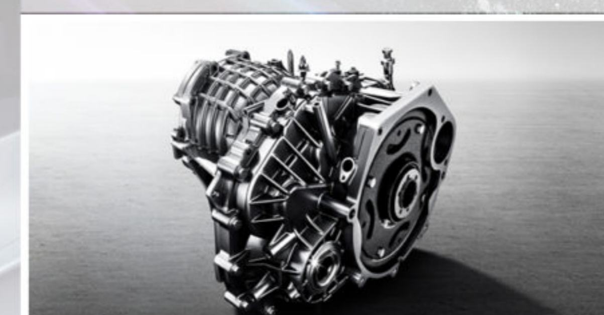
1.5L 4-Cylinder Gasoline Engine