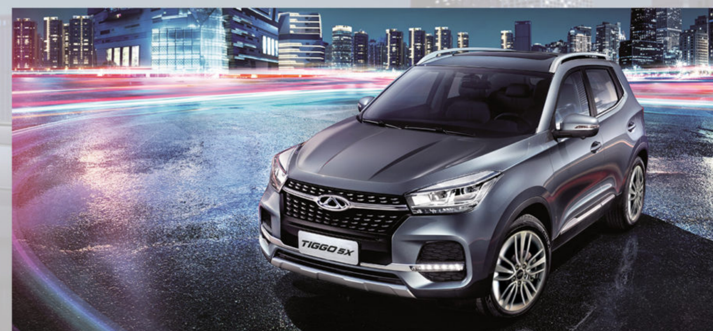
CLASSIC & STYLISH EXTERIORS