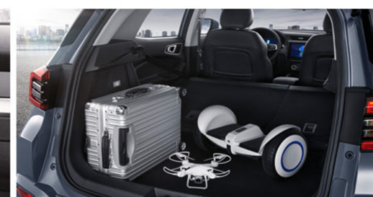
LARGE CARGO AREA