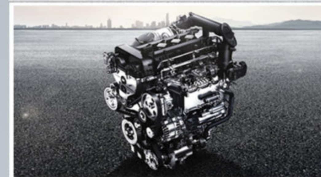
1.5L TURBOCHARGED POWER ENGINE 145 HP AT 210 N-M TORQUE