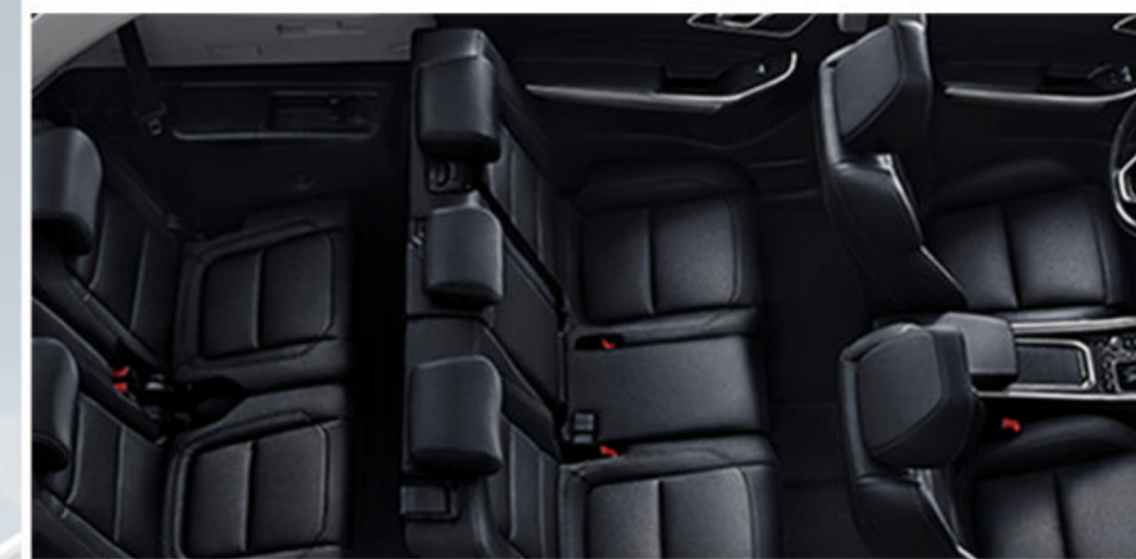
SEATING CAPACITY UP TO 7 PASSENGERS