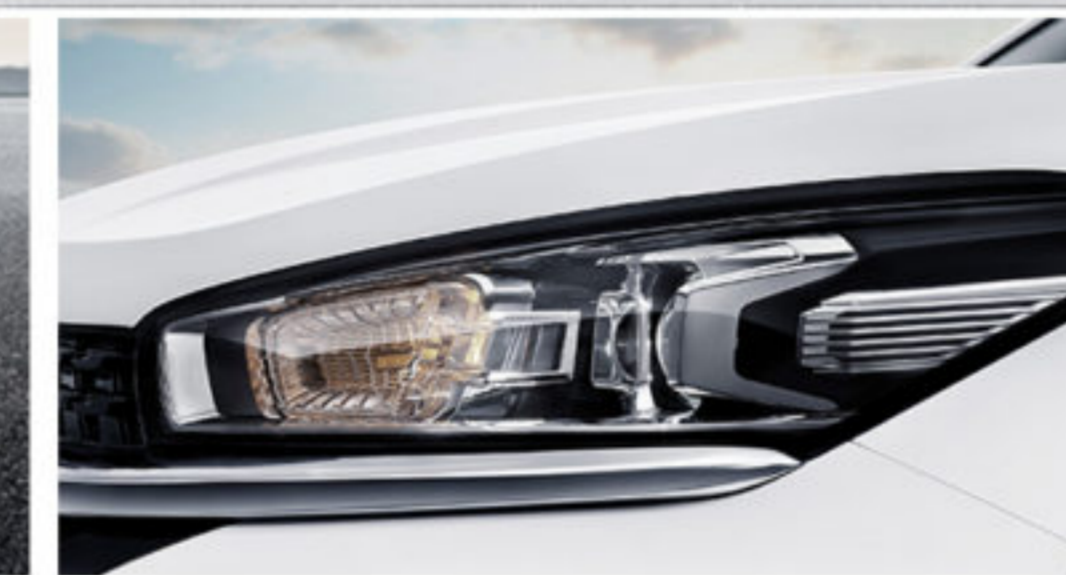
LED MATRIX HEADLAMPS