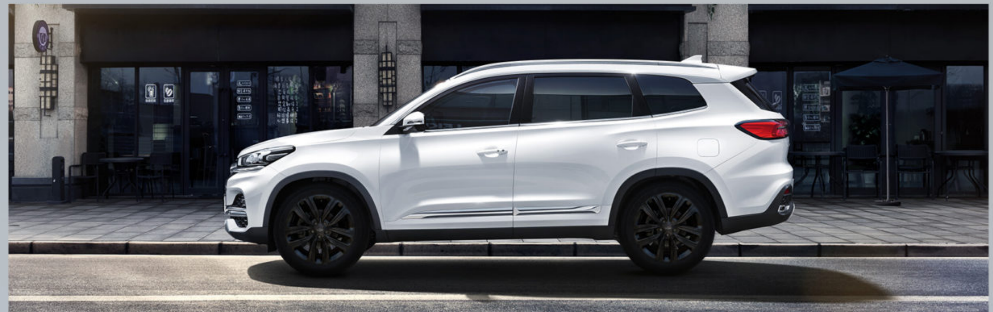
STYLISH AND CLASSIC EXTERIORS

Passive Entry, Remote Engine Start, Window Control, Trunk Lid Opening, Time and Date Display, Incoming Call Reminder and Health Monitoring Functions