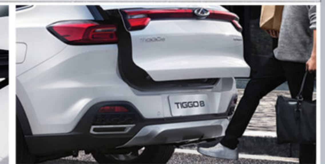
AUTOMATIC TAILGATE OPENING