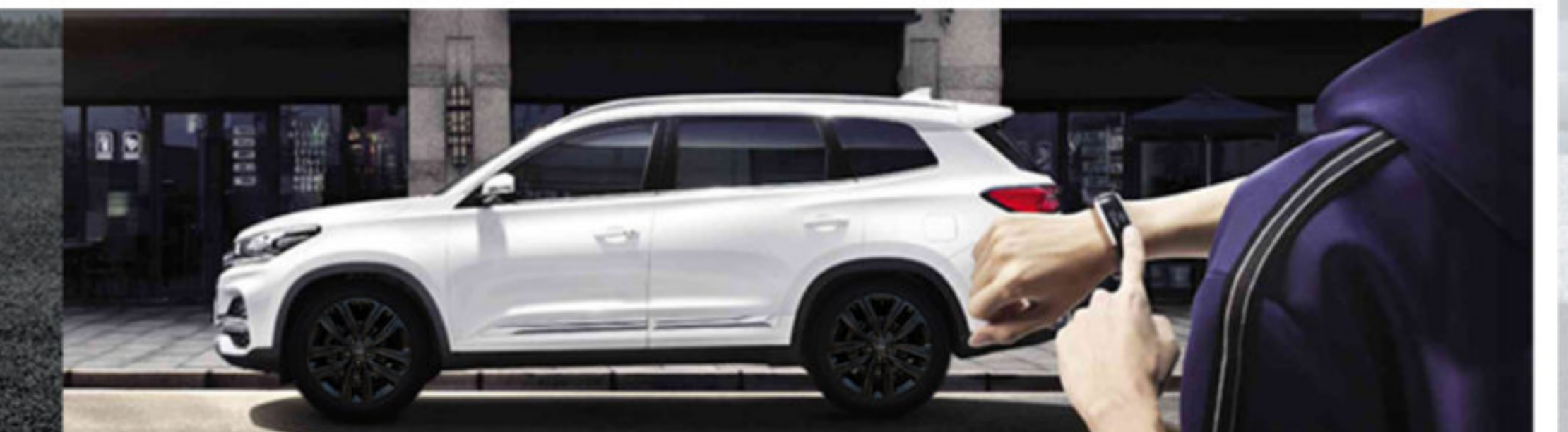
AUTOMATIC CAR CONTROLS VIA DIGITAL SMARTWATCH KEY