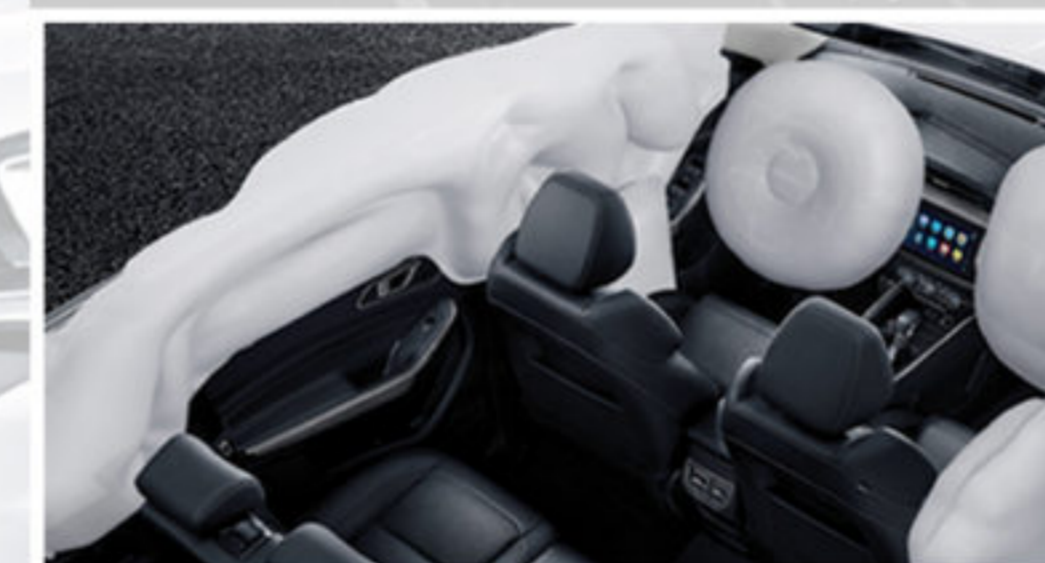
FRONT AND SIDE CURTAIN AIRBAGS FOR MAXIMUM SAFETY