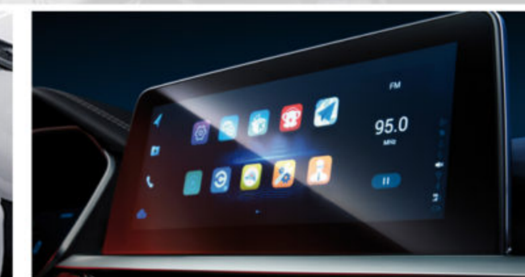
10.25-INCH ULTRA-HIGH-DEFINITION LED TOUCHSCREEN INFOTAINMENT SYSTEM