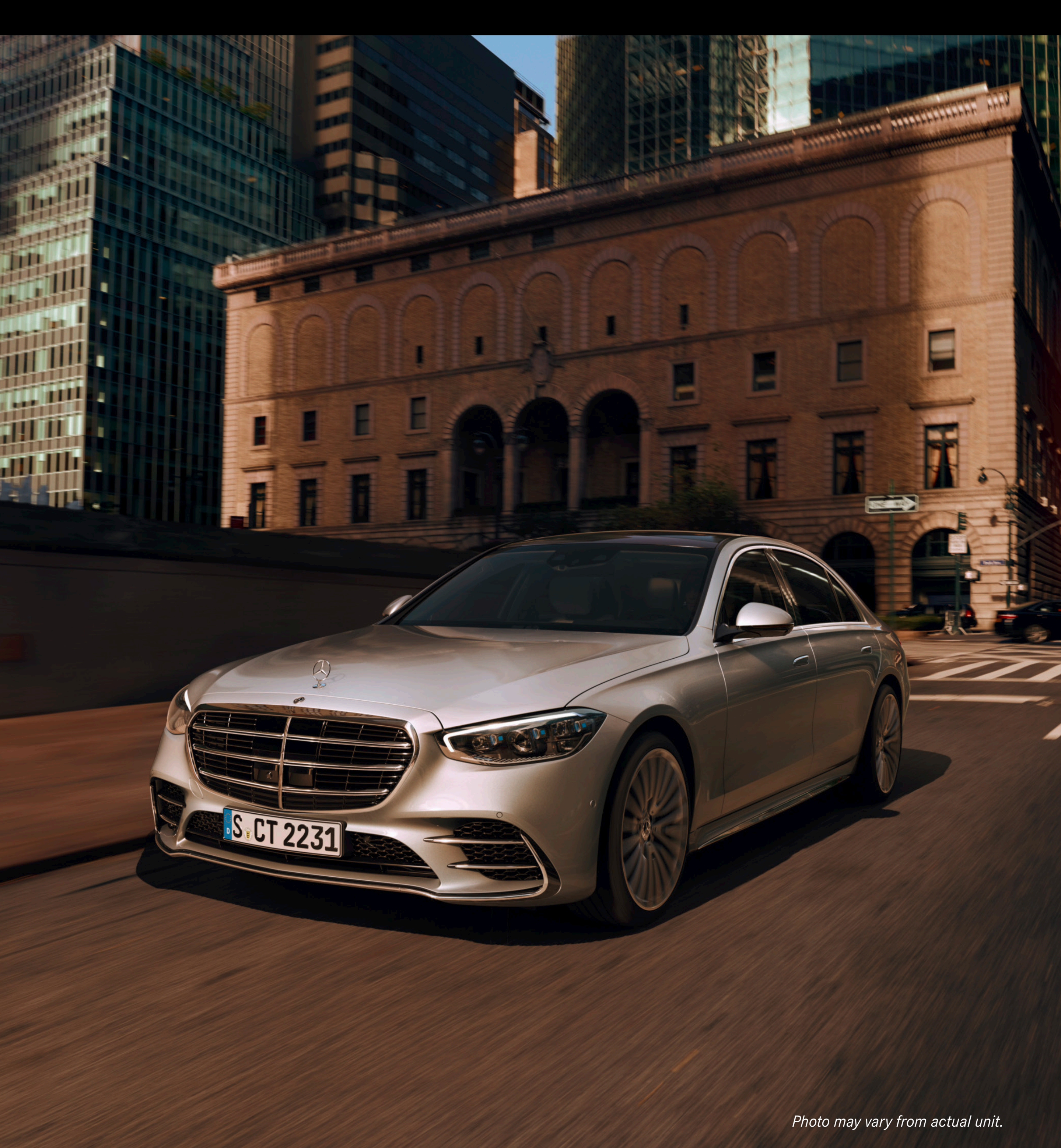
Photo may vary from actual unit.