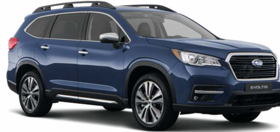
Abyss Blue Pearl

Disclaimer: The information and/or illustrations herein are for illustrative purposes only. Specifications of models may vary across markets and be dependent on local requirements and availability.