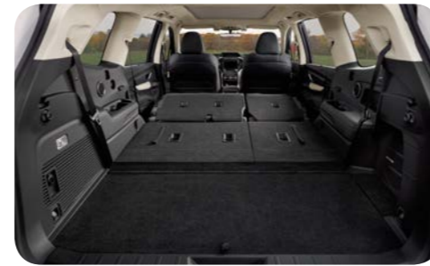
Generous Cargo Space

Disclaimer: The information and/or illustrations herein are for illustrative purposes only. Specifications of models may vary across markets and be dependent on local requirements and availability.