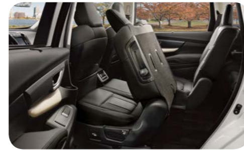
Easy Third-row Access

With many different seating configurations to choose from, the all-new Evoltis is ready for adventures of any size. The generous amount of cargo space fits just about anything while an under-floor storage area helps keep things organised. And with convenient features like the Power Rear Gate and easy-to-use roof rails, there's almost no task too big for the Evoltis.