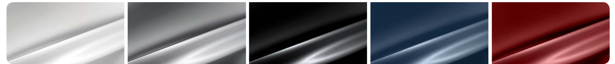
Crystal White Pearl